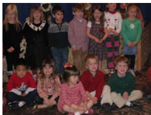
In December, the All-day fours children sang for the Senior Adult Christmas luncheon.