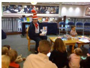
The December Barnes and Nobles Fellowship Event made approximately $300 for the CDP Library. Thank you to all who attended.