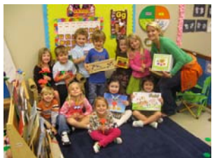
CDP Students enjoy their new "Wish List" items provided by the Parents' Club. Items included age appropriate educational toys and games for each class.