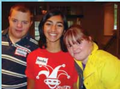
in the church