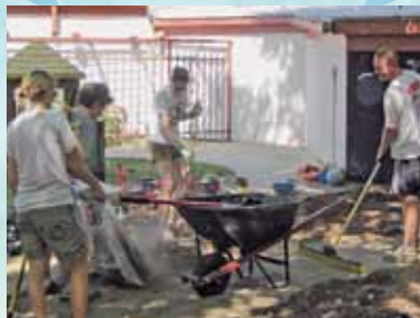
in the community