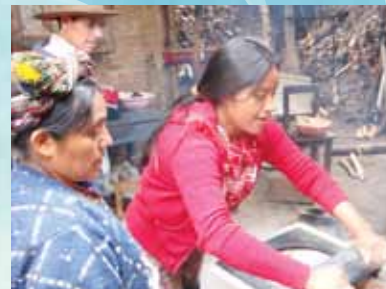
in the world